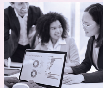
FUNCTIONAL RESOURCE MANAGEMENT